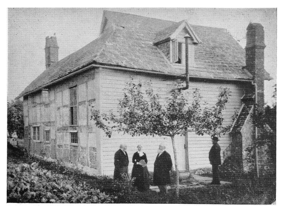
Figure 1: Undated photo showing the meeting house before the extension of 1934-5 (Lidbetter (1979), plate 39, reproduced with kind permission of Mark Sessions)